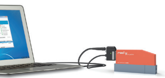
Fig. 2 Configuration of the devices via the free get red-y software