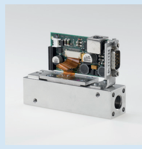
Fig. 3 High-tech in a very compact design: The flow meters and controllers use advanced MEMS technology

Through the application of high-precision MEMS technology (CMOS sensors), the thermal flow meters and controllers from Vögtlin Instruments GmbH set new standards in terms of response characteristics and measuring accuracy, and are characterized by maximum convenience: