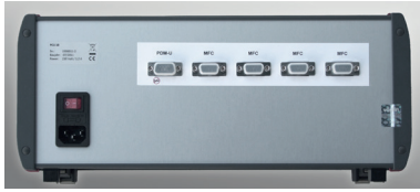
Fig.4 Connections PCU-10 (Art. No. 328-3004)

Desktop case with 4 Sub-D connectors 328-3004 Desktop case with 8 Sub-D connectors (delivery time upon request) 328-3007 Switch panel mounting version 328-3005 19" Rack insert 328-3006 BFC cable for connection of a meter or controller, 2m 328-2163 PDM-U cable for connection to a bus power cable, 2m 328-2169 BAM cable, bus analog module, 0,1m 328-2151 BEC cable, bus expansion cable, 0,5m 328-2160 BEC cable, bus expansion cable, 2m 328-2161 BEC cable, bus expansion cable, 5m 328-2162 BTM terminal plug, bus termination module 328-2139