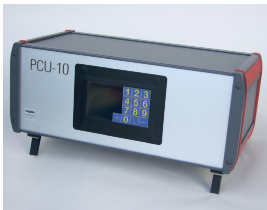
Fig.1 PCU-10 Display and Control Device for the thermal Mass Flow Meters and Controllers of the red-y smart series

The PCU-10 permits the operation of up to 10 flow meters of the red-y smart series with predefined process recipes. The compact control unit with a color touchscreen and integrated power supply comes supplied as a desktop device, switch panel mounting variant or in the 19" plug-in unit. The connected red-y smart meter and controller are automatically detected and displayed with serial number, measurement range and calibrated gas type. The four operating modes single instrument control, gas mixer, master-slave mixer and burner controller are available in English. The saved values are stored in an EEPROM memory which does not require a back-up battery. The desktop case version comes supplied with the PCU-10 , a CD with the get red-y software, as well as the power cord. The front panel mounting variant – and the 19" plug-in unit variant come supplied with a CD, but without a cable.