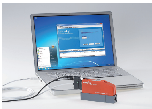
Fig.2 get red-y Software